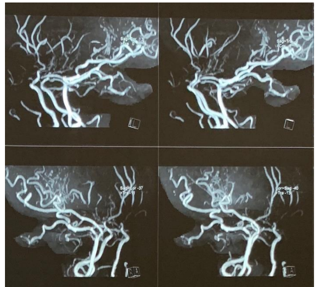
Figure 2: Collaterals on MRA.

The patient had a history of right-sided hemiplegia with residual weakness. So, we did a complete neurological examination with imaging. The patient had no episodes of loss of consciousness and seizures. He was alert, active and oriented to time, place and person. The sensory system examination was normal. On examining the motor system, he had decreased power on the right side (Grade 3/5) as compared to the left side (Grade 5/5). The cranial nerves were normal on testing. We also did a Lumbar puncture, which showed normal values and pressures. Gram and Zeihl-Neelsen (ZN stains) were negative. The electroencephalogram (EEG) was normal. Magnetic resonance angiography (MRA) showed a picture, which was consistent with Moyamoya disease. Figure 2 shows a typical puff of smoke appearance due to branching collaterals.