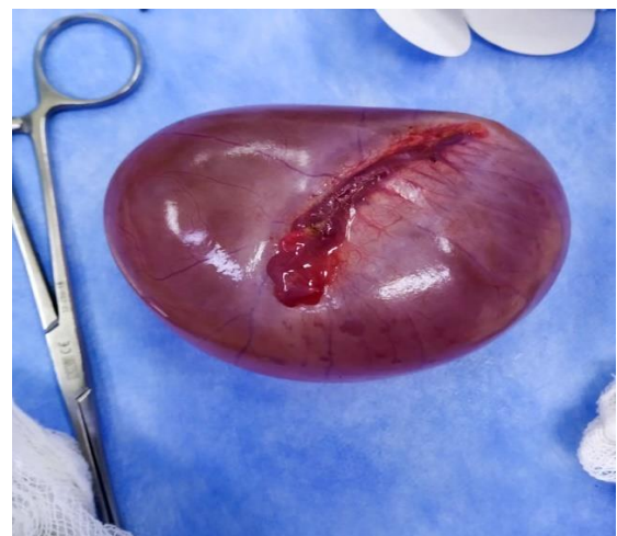
Figure 4: Specimen after Salpingo-oophorectomy.

With these provisional diagnoses, patient was taken up for surgery in view of progressive abdominal distension while maintaining adequate hydration and transit protocol. Exploratory laparotomy was done through right upper transverse incision under General Anesthesia with