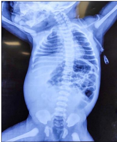
Figure 1: X-ray abdomen showing lower abdomen mass with displaced bowel loops.

Investigations revealed all normal blood parameters. Sepsis screen was negative. X-ray chest and abdomen was indicative of displacement of bowel loops towards left hypochondrium and flank with opacity involving right flank and pelvis (Figure 1).