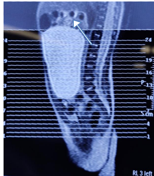
Figure 3: Bowel loops (white arrow) pushed superolaterally (Sagittal view).

further workup on radiological advice. It showed evidence of a large intraperitoneal lesion 7.4x9.2x6.1 cms (CCxTransxAP) displacing bowel loops superolaterally towards left. Lesion was hypointense on T1 and hyperintense on T2; suppressed on SPIR, without any blooming, non-enhancing on post contrast T1W. No evidence of calcification, septation or solid components were noted. Fat planes around lesion were maintained with moderately dilated bowel loops (Figure 2,3). Diagnostic possibilities included omental cyst and ovarian cyst (side could not be confirmed but impression was that of a right sided mass).