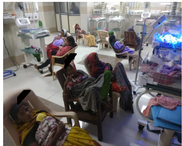
Figure 2: The implementation of KMC in our NICU during night time.