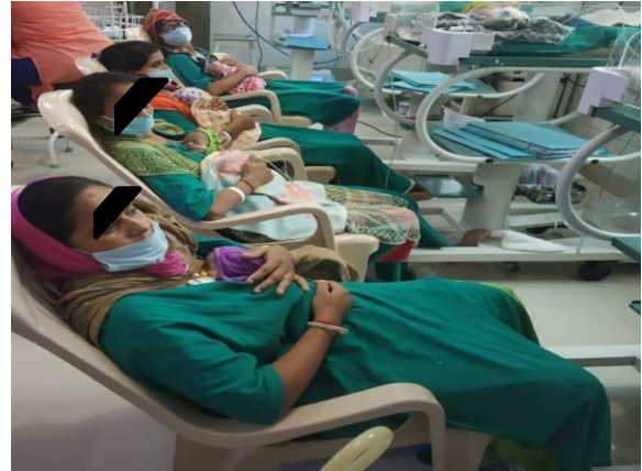
Figure 1: Mothers giving KMC within our NICU.

Mothers were provided special KMC gowns. They were given support by our health professionals working in NICU. Mothers provided KMC reclining chairs. During each session the mother wore a loose clothing (front open garment/ a gown) and the baby was positioned inside her clothing and between the breasts in an upright, frog-like position.